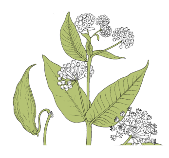
3 Milkweed [white]