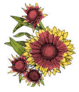
2 Indian Blanket [red and yellow]