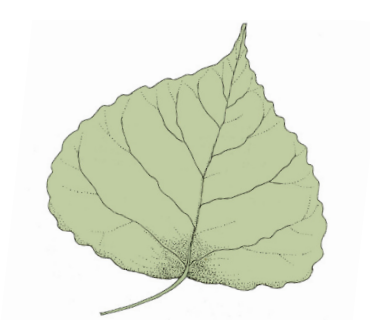
7 Cottonwood Tree