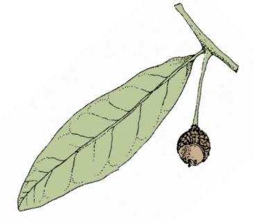
5 Live Oak Tree