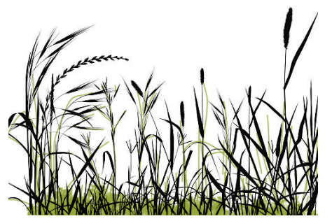
6 Prairie Grass