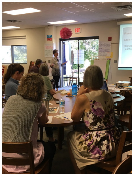
In the fall, the board participated in a three-year strategic planning process, graciously hosted by Rosemont Elementary School. We are excited to implement planned improvements to site management, education, partnerships, fiscal management and human resources.