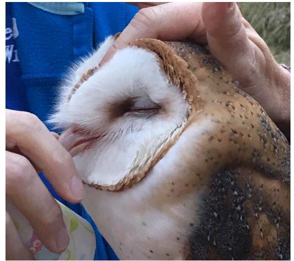
Participants in a recent evening nature walk got to pet special guest Forest the Barn Owl.